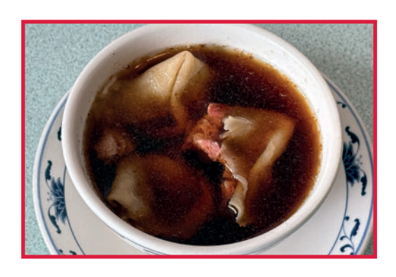
WON TON SOUP