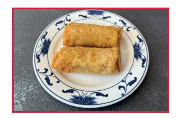
PORK EGG ROLLS