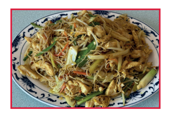
SINGAPORE MEI FUN