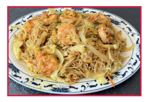
SHRIMP LO MEIN