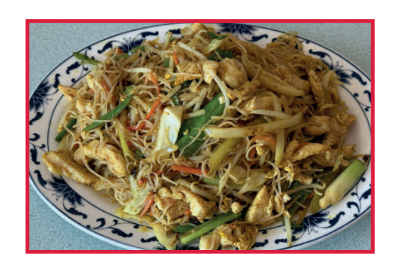
SINGAPORE MEI FUN