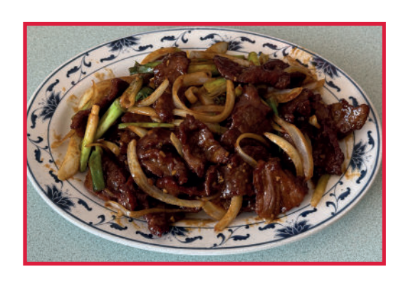
SIZZLING STEAK CHINESE STYLE